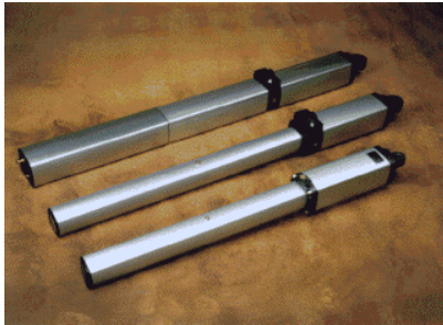
4LR (Residential) swing-gate operators

These gate operators have all of the features of the 3LR range but also have a larger tank for intensive applications as well as longer stroke options.