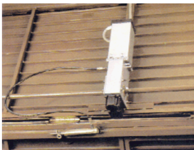
Minimax medium duty garage door operator

These garage door operators have all of the features of the Minimax range but also have a larger tank for intensive applications as well as higher force for larger doors and various locking options. Damping at both ends of stroke as standard.